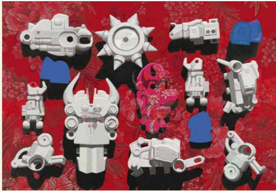
Image: Dongwang Fan, Descendants # 1 - Red Environment , 1995, synthetic polymer on canvas.

This collection that was developed over the past 25 years has been grouped into a number of categories: Funerary and Storage Objects, The Development of the Celadon Glaze, Symbols, Dragons, The Scholar's Desk, Chinese Birds, Japanese Birds. The exhibition also includes Contemporary works by artists who were born in China and Japan: Dongwang Fan and Tie Hua Huang.