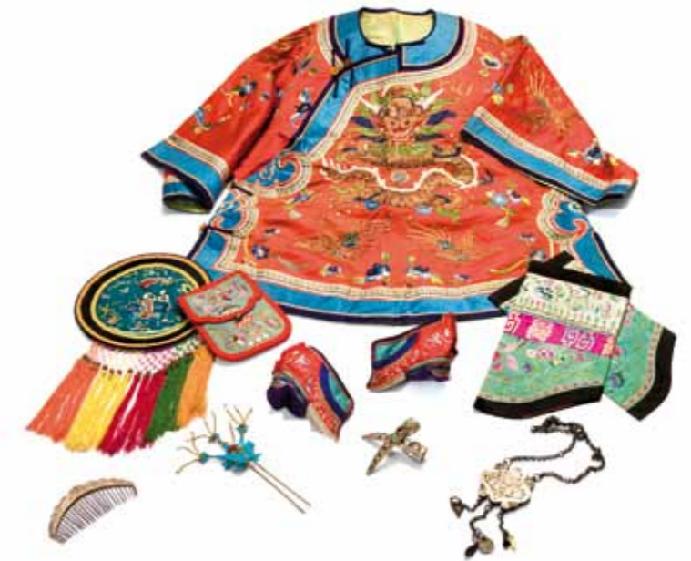
Image: Chinese artifacts, Roger Grellman Collection.

Floor talk Curator in conversation with collector Roger Grellman Wednesday 1 December, 12 noon.