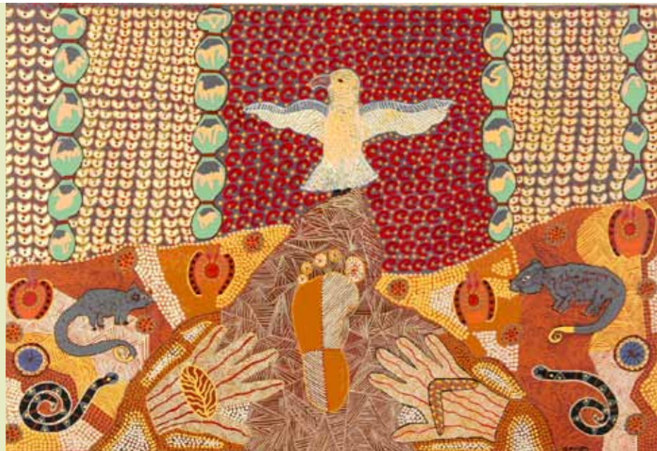
Image: Georgina Parsons, Hanging Rock , 2002, synthetic polymer paint on canvas.

Murrumul - An Education Kit for the Aboriginal Collection is available from the Gallery shop.